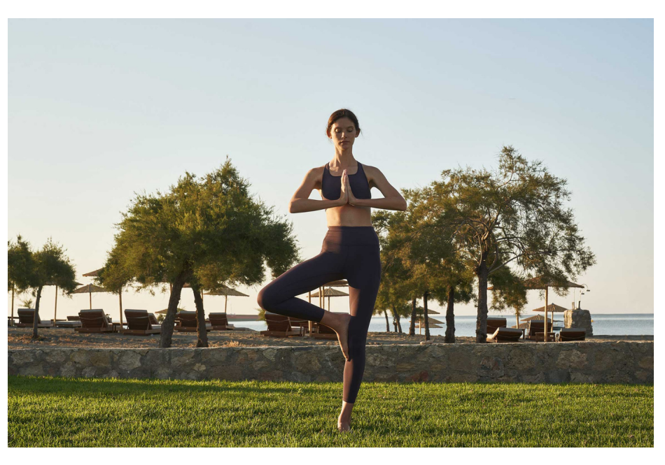
EXPLORE MORE AT WWW.LINDIANVILLAGE.GR

Gym: 24-hour access Tennis Court: Available with complimentary access and equipment. Private lessons are also available with extra charge. Yoga Room: Complimentary Access